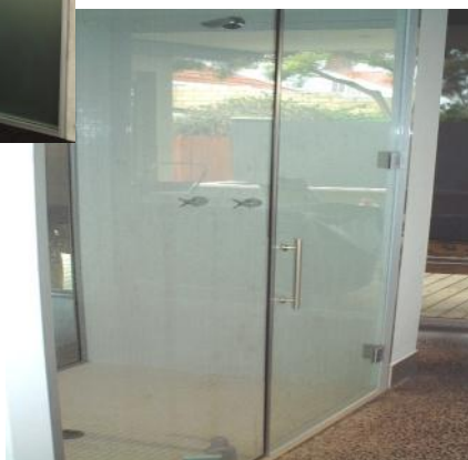
Frameless Shower Screen