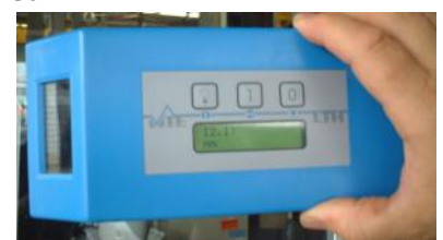
Electronic glass measuring device