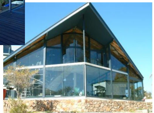
Energy rated windows