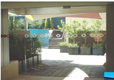
Toughened Glass Assembly